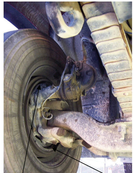
Brake shoes and brake drum.

based brake tester (PBBT) at regular intervals to monitor brake performance over the life of the linings. This research is being conducted as part of an 18-month Field Operational Test.