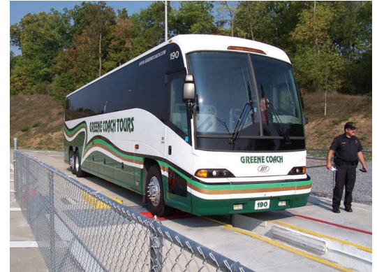
Motor coach entering the PBBT at the Greene County Inspection Station, Bulls Gap, Tennessee.

To facilitate this research, the Federal Motor Carrier Safety Administration, in partnership with the Oak Ridge National Laboratory and the Tennessee Department of Safety, has installed a performance-