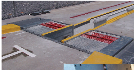
Roller based PBBT.